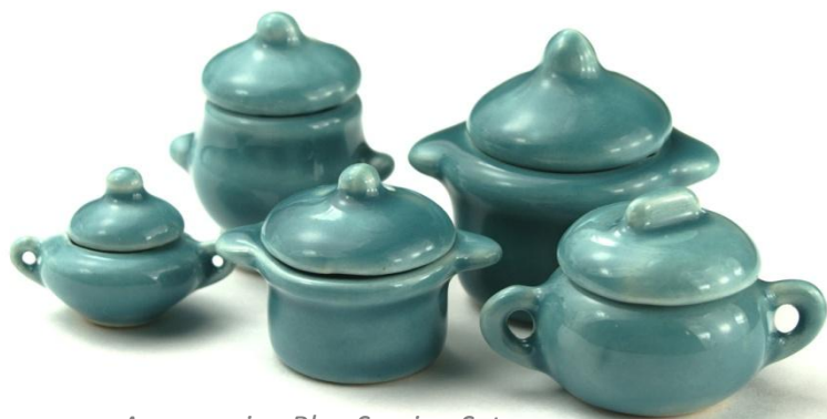
Aquamarine Blue Serving Set