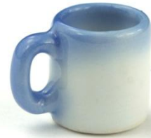
White & Blue Rim