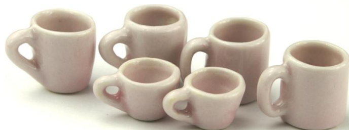
Hint of Pink Cup Set