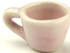
Hint of Pink