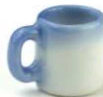
White & Blue Rim