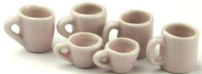
Hint of Pink Cup Set