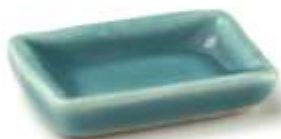
Aqua Marine Blue