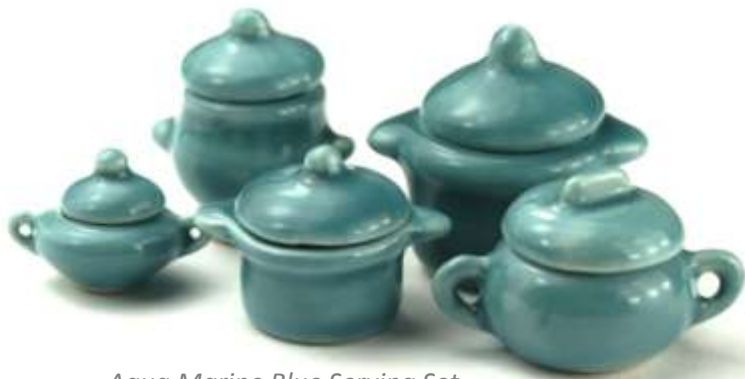
Aqua Marine Blue Serving Set