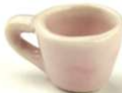
Hint of Pink