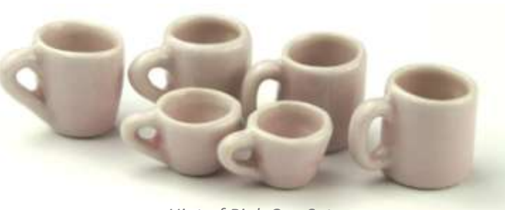
Hint of Pink Cup Set